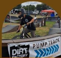
PUMP TRACK FOR ALL AGES