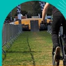
AIR BAG JUMP FOR AGES 10+

Under 12's must be supervised by an adult. A limited number of bikes and helmets are available, please bring your own equipment if possible. See you there.